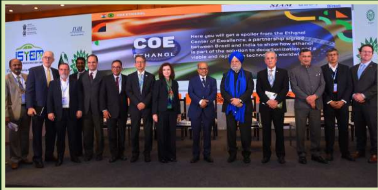
SIAM - UNICA Ethanol COE Launch

Aligned with the vision of sustainable mobility, SIAM organized the 1st Edition of the ISTEM Conference in New Delhi. The event was graced by the distinguished presence of the Chief Guest, Shri Hardeep Singh Puri, Hon'ble Union Minister of MoP&NG, alongside eminent speakers from the government and industry leaders from India and around the world.