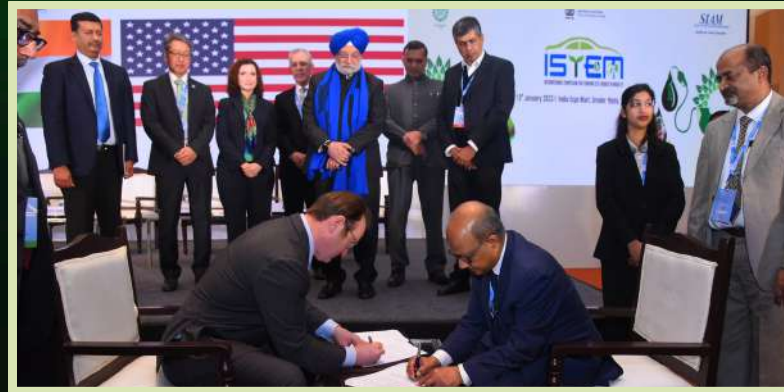
SIAM - USGC MOU Signing