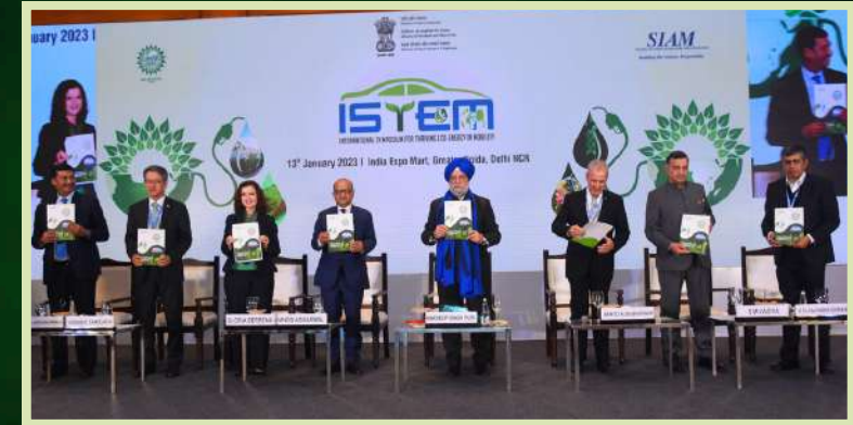
Biofuels Context paper unveiling